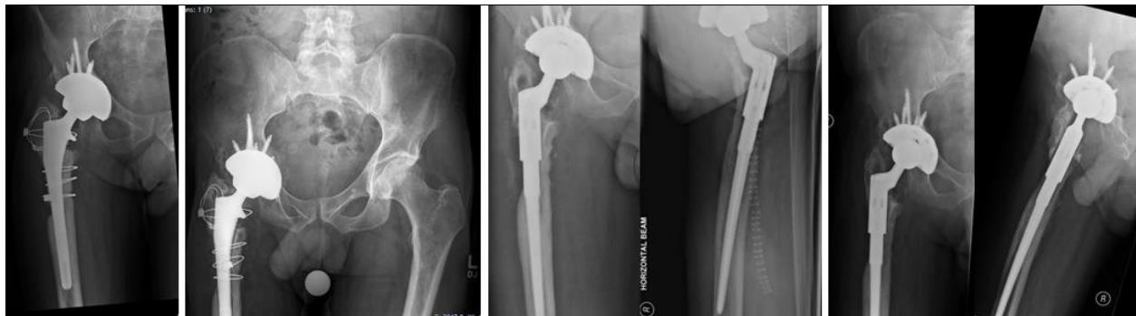
Figure-5: 1-year post-op. Complete resorption of bone under distal two cerclage wires on lateral aspect