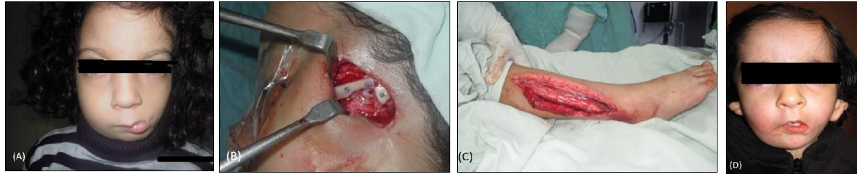
Figure-1: (A) 4-year-old girl with left sided Pruzansky's type III mandibular hypoplasia (B) Temporomandibular joint reconstruction with rib cartilage graft. (C) Free fibula flap harvest for mandibular reconstruction. (D) Post operatively good symmetry achieved.

in adult group the maximum follow-up was 6 months and minimum follow up was 10 days. In patients where vascularized bone flap was used, there was satisfactory union at flap and native bone junction.