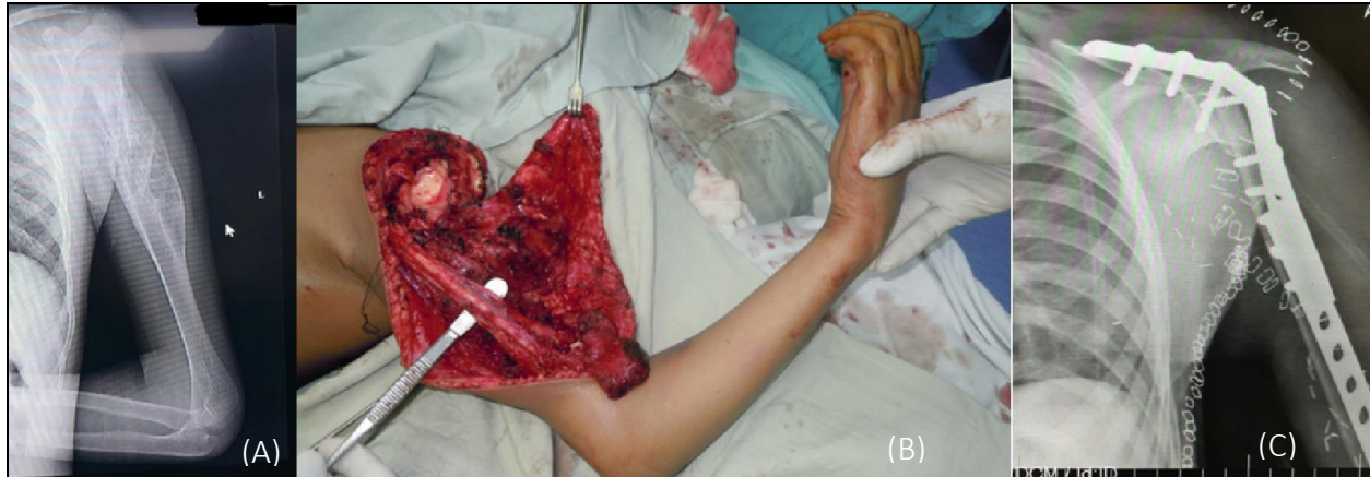
Figure-4: (A) Radiograph of a 12-year-old boy with left humerus Ewings Sarcoma. (B) Wide local excision of tumour and salvage of neurovascular bundle (C) Free fibula flap for humours reconstruction, good union at 5 months follow up.