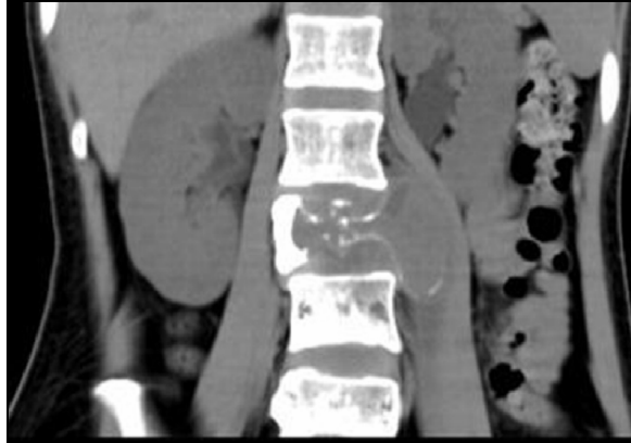
Figure-2: Sclerotic margins in the vertebral body involving the posterior elements and vertebral body, without involving the intervertebral disc. The vertebral density is uneven, visible on the left side of the vertebral bodies; soft tissue density is uneven, with shifting of left psoas major