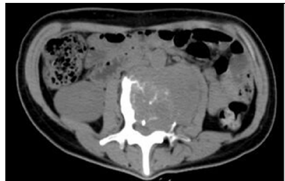
Figure-1: The shape of third lumbar vertebrae is irregular, bone destruction and calcification were pronounced in axial CT. A large soft tissue density mass occupied the spinal canal and effected the nerve root on the left.

The resected sampling enclosed dispersed benign massive cells and same round cells (possibly, chondrocytes), as well as bone matrix, calcified cartilage, and connective tissue (Figure-3). Associated with the earlier studies, calcification like chicken-wire outline was not seen in our case. We see the identical mononuclear round tumour cells with a massive amount of eosinophilic cytoplasm, mixed with randomly distributed osteoclast kind massive cells.