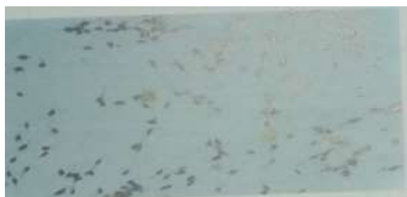
Fig III: 24Hrs culture from CP SN (8Wks) showing SC with different morphologies & unstained FB (LMN: ABC method). OMx100