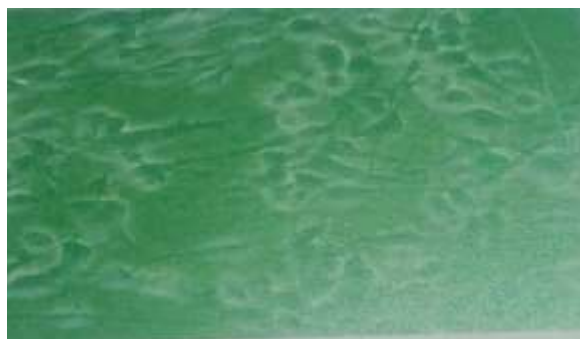
Fig II: 24Hrs phase contrast photomicrograph of glioma dissociated cells showing many bipolar & some rounded SC along with debris. OMx200.

(a) The weight (mg/animal) given are that of fresh, wet and stripped tissue., (b) No. of animals in each experiment were 8 (fresh) & 5 (glioma) on average, (c) Figures in parenthesis are number of experiments, (d) In case of DRG minimum of 60 ganglia (minimum of 3 animals for each experiment) were obtained from one animal.