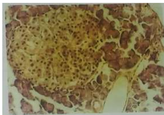
Figure 2: Photomicrograph of pancreas from group E showing an islet of Langerhans with normal number of p-cells arranged centrally, intact cytoplasmic and nuclear morphology. X 500

The animals in experimental group D showed a gain in their body weight but this was not significant statistically. Their general condition however appeared to be satisfactory.