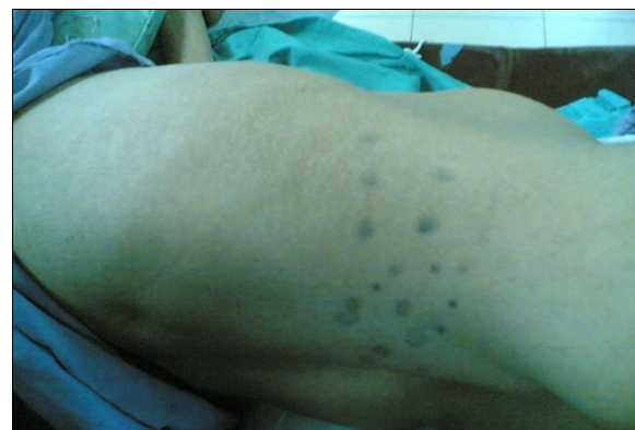
Figure-2: A patient treated by a quake for renal stones, later presenting with non-functioning kidney