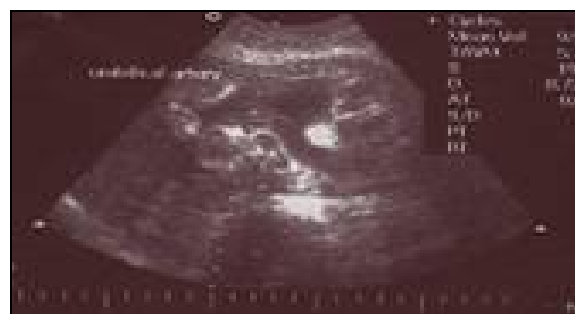
Figure-1: Absent end diastolic flow in UA Doppler waveform