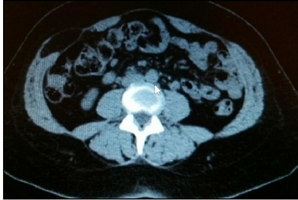
Figure-1: Coronal CT scan abdomen

the first stitch to the defect and the rest of the mesh was tacked securely in place using Ethicon Secure strap absorbable fixation device. Her postoperative recovery period went uneventful and was discharged on oral medication on the 3 rd day after achieving good pain control. Her follow up visit was arranged after a week with no complaints.