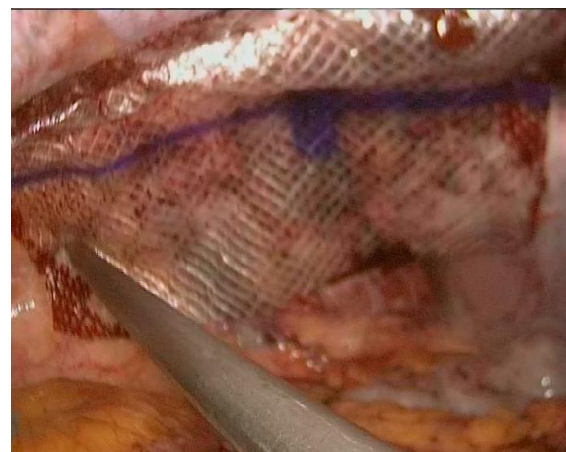
Figure-6: Placement of composite mesh over defect