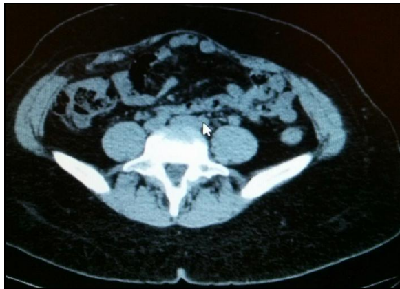
Figure-2: Coronal CT showing defect