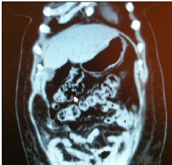
Figure-3: Sagittal CT slice depicting hernia sac