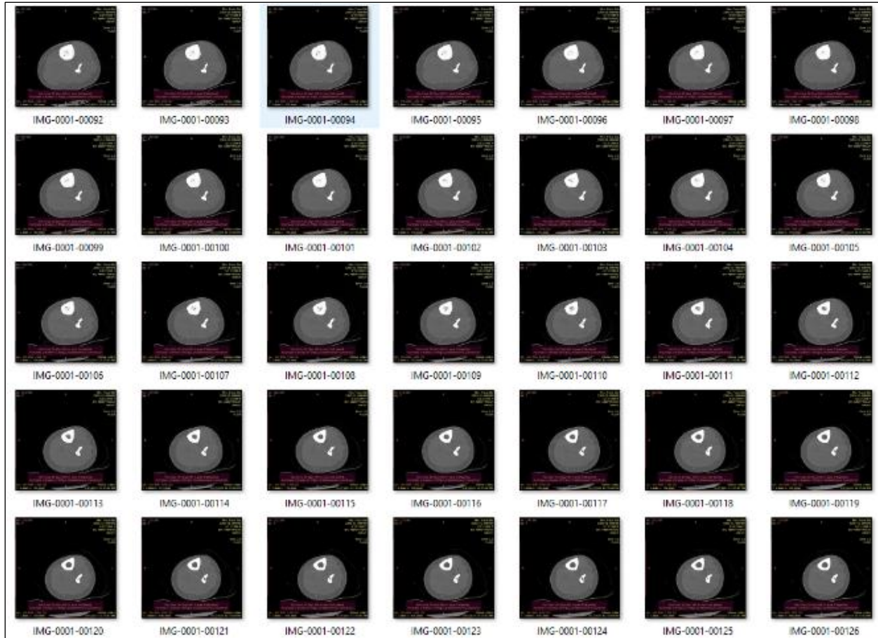
Figure-3: CT scan confirming the findings of the MRI and ruling out any osteoid osteoma or osteochondroma.