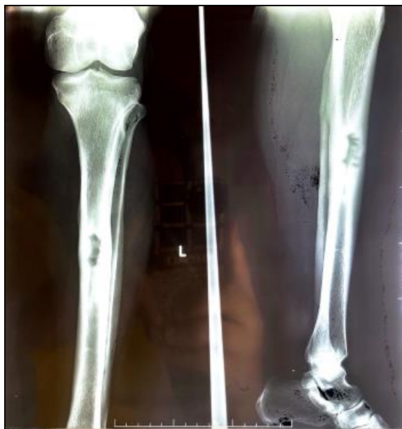
Figure-4: Follow-up X-ray after three months showing regression of the periosteal reaction