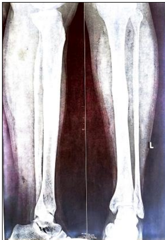
Figure 1 X-ray showing a lytic lesion with periosteal reaction involving the mid-shaft of the left tibia.

showed clinical improvement with resolution of pain and swelling. The plaster cast was removed after six weeks and she was advised to do physiotherapy exercises. The follow-up X-ray after three months showed regression of the periosteal reaction (Figure 4). The patient was asymptomatic at six months follow-up.