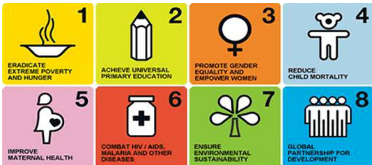
Figure-1: United Nations. The 8 Millennium Development Goals. New York: 2001

The consensus of the international community is to gear all efforts toward building the equitable, effective and client-friendly health systems required to achieve the MDGs and move on beyond 2015. Investing in health necessitates in-depth research to visualize the real determinants of health-seeking behaviours and health services utilization among the most vulnerable sub-groups of the population. 8 Besides money which really matters, government must reflect the commitments through a healthy public policy, a responsive health system, a meaningful partnership with private sector, across the board accountability, and a strong stewardship. 9