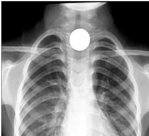
Figure 2: A radiopaque foreign body in the upper oesophagus

odynophagia to no symptoms at all. Whereas foreign body ingested at the level of cricothyroid can give a varied presentation and might as well present with cough and drooling of saliva giving the suspicion of foreign body aspiration. 13 The management of oesophageal foreign bodies varies from place to place to site of impaction to time of presentation. According to our data most common site of impaction was the upper oesophagus this is in accordance to Smith et al. 14