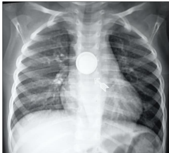
Figure 3: A button battery in the mid-oesophagus (note the halo sign)

radiopaque density whereas a button battery will produce a halo sign. Figure 3