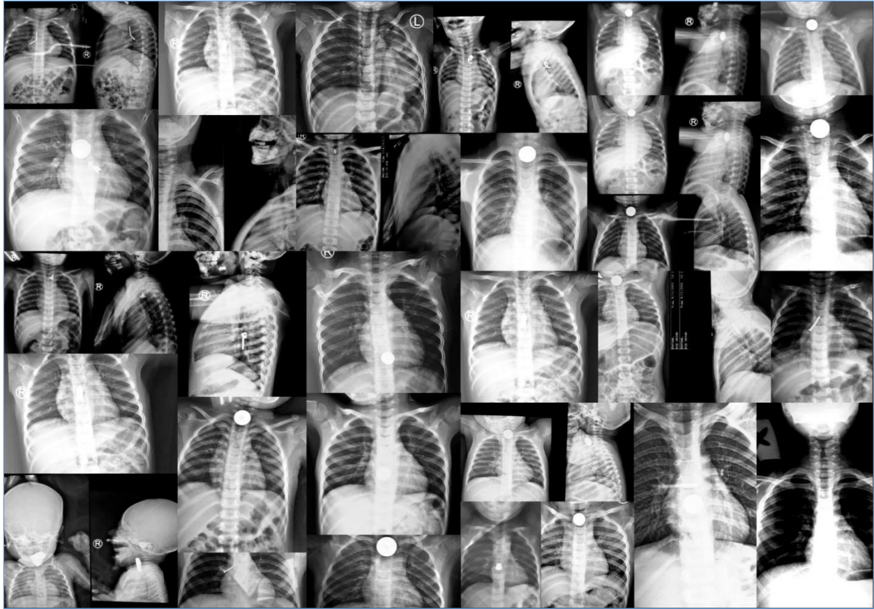
Figure-1: Foreign bodies lodged in ADT

Our study aimed to evaluate and determine the outcomes of foreign bodies lodged in the ADT at our paediatric surgery department and to compare this data in ingestion and aspiration groups. And to attract the attention of caregivers and parents regarding the dangers of foreign body ingestion.