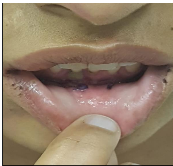
Figure-4: Vestibular incisions after closure