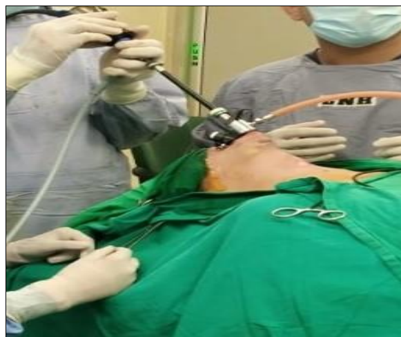
Figure-3: Insertion of endoscope during procedure