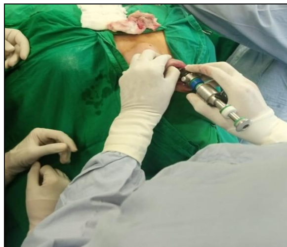
Figure-2: Insertion of trocar during surgery