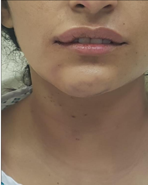
Figure-5: Patient satisfied from the result of surgery